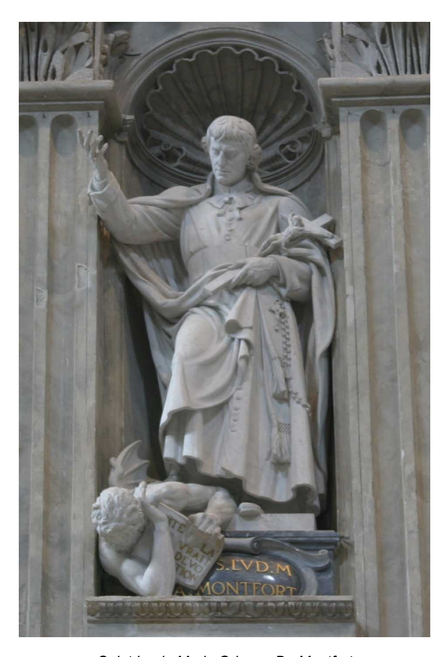
Saint Louis-Marie Grignon De Montfort